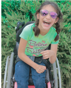
Midland Children's Rehab Center