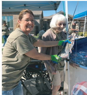
Manor Park Fishing Derby