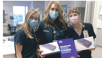
March of Dimes