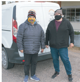
Meals on Wheels Alpine