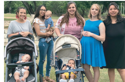
Young Lives Camp