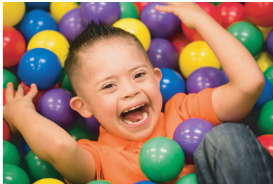
Permian Basin Rehab Center

All of the Foundation's grants are awarded through donor recommendations, allocations from designated funds and agency endowments, and the semi-annual competitive grant cycles.